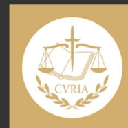
Logo of App